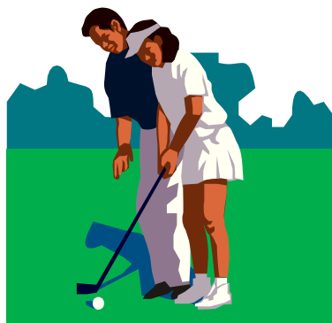
Bring your golf swing and enjoy

PLEASE MAKE SURE TO INDICATE ON YOUR CHECK THAT IT IS FOR THE GOLF TOURNAMENT